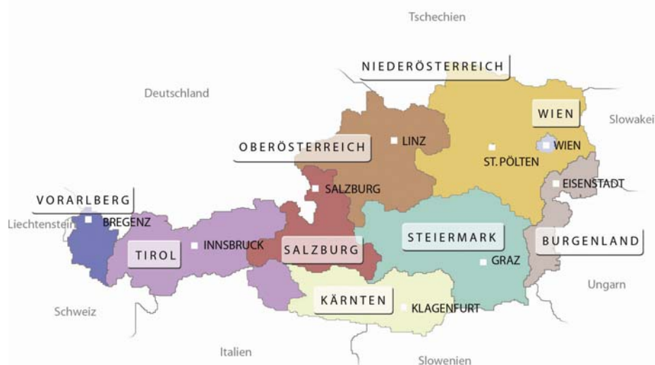
FIGURE 1 in 0101

The head of state is the President. S/he appoints the Federal Chancellor ( Bundeskanzler ) who is head of the Federal Government. The Austrian Parliament has two chambers – the National Council ( Nationalrat ) and the Federal Council ( Bundesrat ). The members of the National Council are directly elected by the people every four years. The Federal Council represents the interests of the federal provinces. Its members are delegated by the provincial parliaments ( Landtage ).